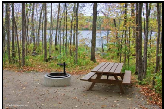
Limited Agent Inspections