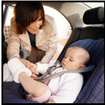
Car Seat Checks