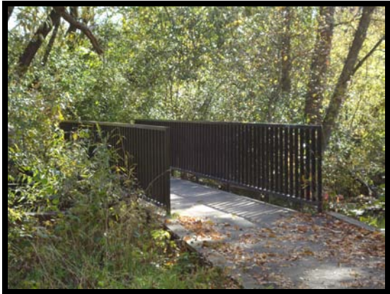
Healthy Ways and Health Promotion Activities