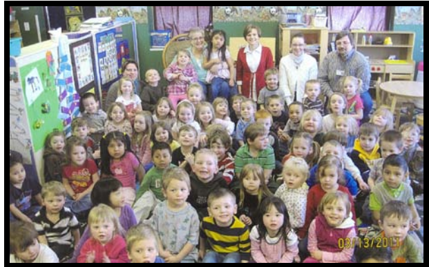
Head Start Programs