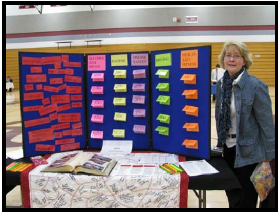
Teen Health Activities