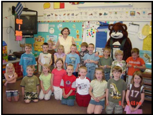
Youth Outreach Programs