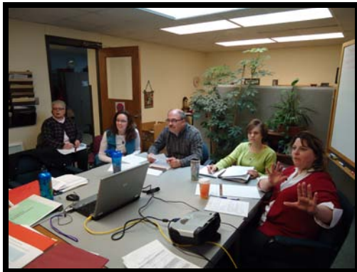
Emergency Preparedness Training