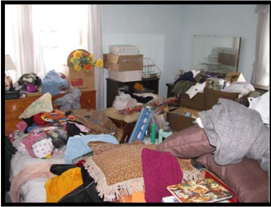
Health Hazard Investigations