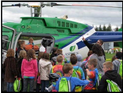
Kids Safety Day 2010