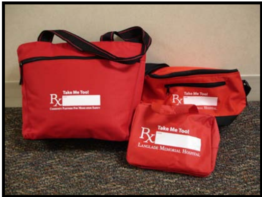
Red Bag Program